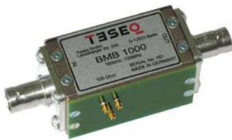
BMB 1000, LCL measuring bridge