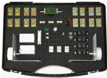
CAS ISN with all options in suitcase

The calibration kit CAS ISN is made for function tests and remeasurements on impedance stabilization network (ISN) for unshielded balanced pairs. Measuring parameters are common mode (CM) impedance, phase angle, voltage division factor, decoupling attenuation (isolation) and longitudinal conversion loss (LCL). Impedance stabilization networks (ISN) are defined in CISPR 22 and CISPR 16-1-2. The CISPR 16-1-2 gives additional requirements and provides examples and measurements for the networks. The ITU-T recommendations G.117 and O.9 offers the background knowledge for measurements on symmetrical telecommunication lines.