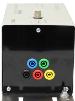
CDN A501, view to the EUT port