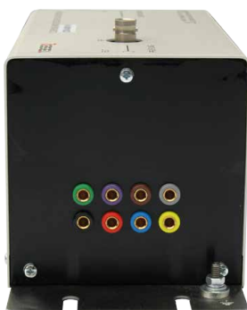
CDN A801, view to the EUT port