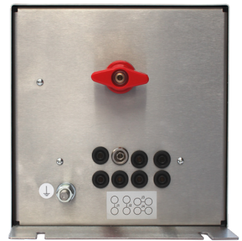
HV-AN 150, view to the AE port