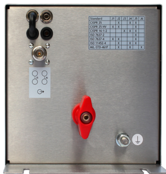
HV-AN 150, view to the EUT port