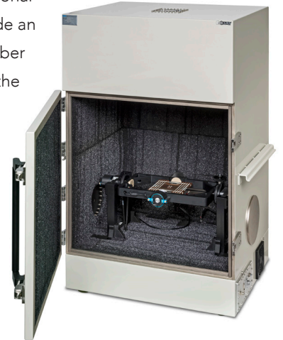
28 GHz/39 GHz OTA Beamforming Test Chamber

LitePoint's 5G mmWave optional test fixturing solutions include an OTA (over-the-air) test chamber for testing beamforming of the DUT's mmWave antenna structures.