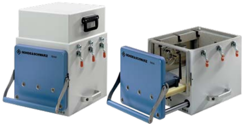
R&S® TS7123M with elevated cover and brackets for additional test equipment

The optional elevated covers provide sufficient room for the integration of further test equipment such as CCD cameras or keyboard stimulators above the DUT. For the integration of additional test equipment, you can use the brackets on both sides of the RF test chambers.