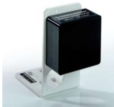
R&S® TS-F2x-B2 Bluetooth® and WLAN b/g antenna coupler

By using the R&S®TS-F21FU2 and R&S®TS-F23FU2 options, you can feed USB 1.1 and USB 2.0 signals to the RF test chamber for controlling the DUT and the test equipment in the RF chamber.