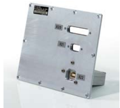
R&S® TS-F23FU2 exchangeable connector plate of the R&S® TS7123 with USB feedthrough

Customer-specific fiber-optic link and pneumatic feedthroughs are also configurable on request.