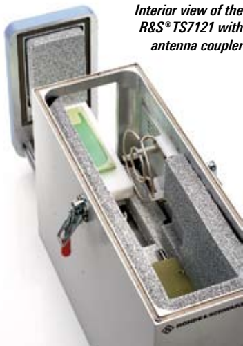
Interior view of the R&S®TS7121 with antenna coupler

The lower compartment of the base accommodates the guide rails and, in the case of the automatic versions, also the pneumatic system including the pressure regulators and valves. The valves and the feedback sensors are controlled via a 24 V connector.