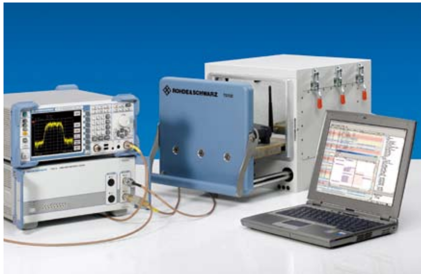
R&S®PTW70 WLAN protocol tester with R&S®TS7123M