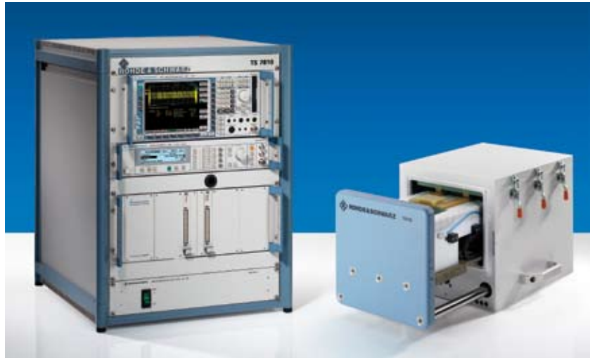
R&S®TS7810 RF test system and R&S®TS7123A RF test chamber with pressure chamber

Elevated covers are available for both RF test chamber models, allowing the integration of additional test equipment above the DUT.