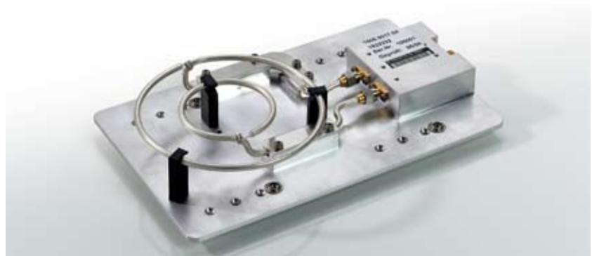
R&S® TS-F2x-G GSM/CDMA2000®/WCDMA antenna coupler

Antenna couplers for all important mobile radio standards as well as for WLAN b/g, ISM, and Bluetooth® antenna couplers are currently available. The couplers can be attached to the side panels or rear supporting plate of the RF chamber. Customer-specific antenna couplers can also be integrated.