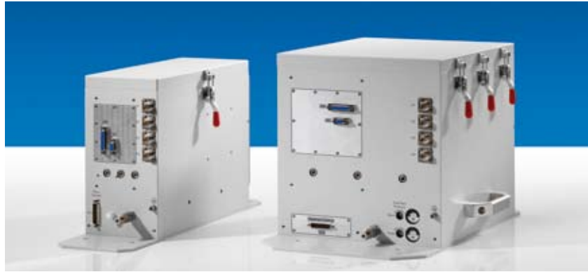
Rear view of the R&S®TS7121 and R&S®TS7123 with exchangeable connector plate and RF connectors

The actual RF chamber is located above the pneumatic chamber. On the RF chamber rear panel, four RF feedthroughs are provided for connecting antenna couplers or DUT RF interfaces. Customer-specific antenna couplers or antenna couplers from Rohde & Schwarz can be attached as required to the side panels or to the rear panel of the RF chamber.