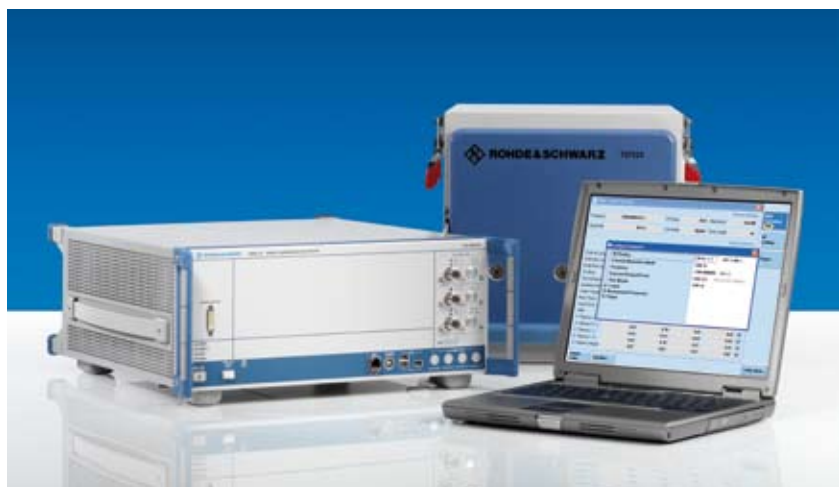
R&S®CMW270 WiMAX communication tester with R&S®TS7123M