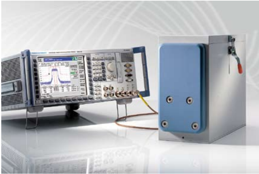
R&S® CMU200 radio communication tester with automatic R&S® TS7121A RF test chamber